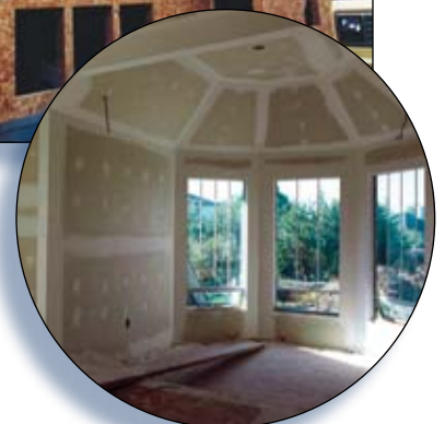
VWTH ARCHIVE PHOTOS